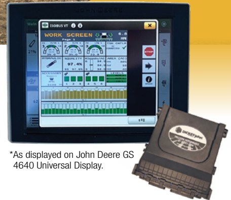
*As displayed on John Deere GS 4640 Universal Display.

The DICKY-john® IntelliAg™ ISO 6 brings the future of application management to your tractor cab with state-of-the-art communication between your planter and tractor. The ISO 6 delivers precise control and monitoring of both standard and advanced planting functions, including planting population, planting quality data (skips, doubles, spacing), granular and liquid fertilizer application, vacuum fan management, row shutoffs, seed hopper level monitoring, advanced tramlining, and more. It also supports Task Controller functions such as variable rate application of up to eight products, along with automatic section control for up to 72 product outlets.