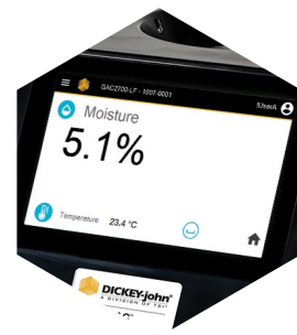
Easy-to-Read Results Screen