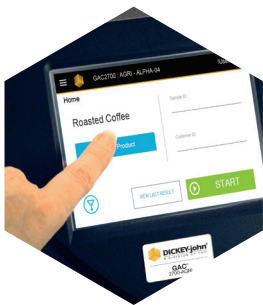
Intuitive Color Touchscreen