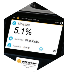
Easy-to-Read Results Screen