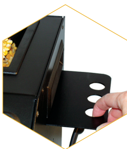
Pull Slide to Test Grain