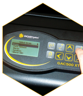
Easy to Use Display

When you buy a GAC™ 500XT you get all the dependability and value you expect from DICKEY-john® products. DICKEY-john's advanced technology and superior electronics are backed by a team of expert, in-house mechanical, electrical, software, and test engineers. Made in the U.S.A.