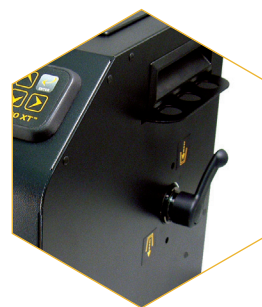
Release Lever to Dump Grain